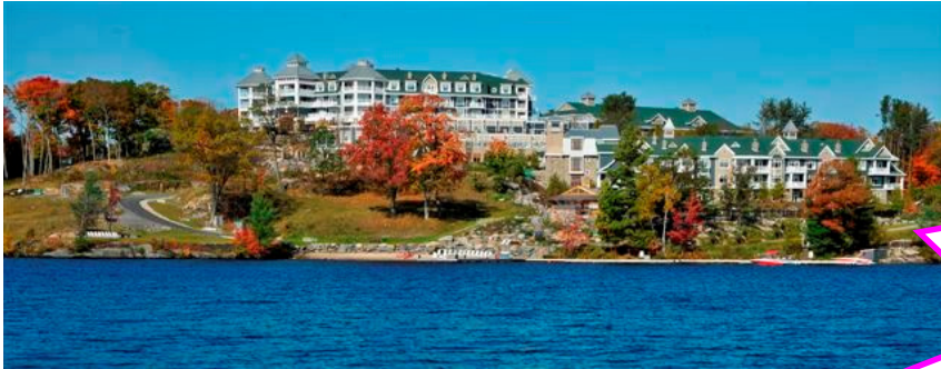
JW Marriott "The Rousseau" Resort & Spa

Get a group of girlfriends, co-workers, or family together and join our Fitness/Spa weekend.